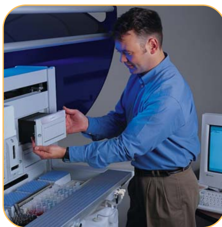
The DSX modular design simplifies upgrades and repairs.