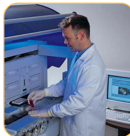
The DSX simplifies workload setup by walking you through where to load consumables and samples