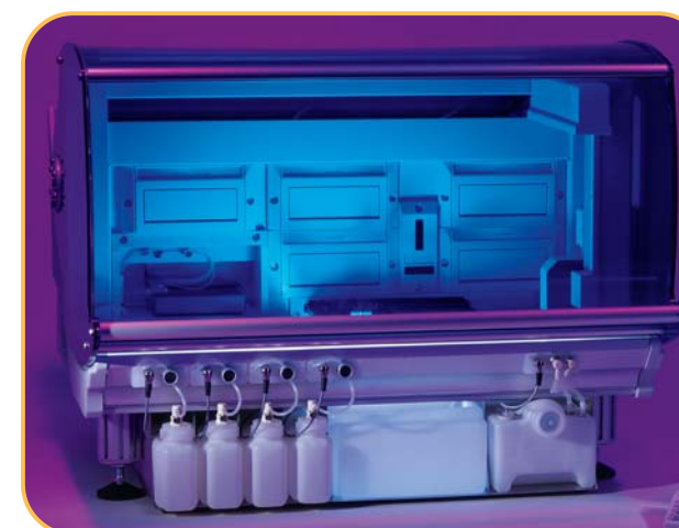
The dark cover protects your reagents and reactions from environmental contaminants, securely locking during the entire assay run.