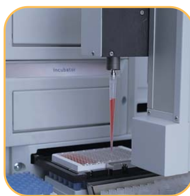
The DSX robotic arm moves microplates and pipettes all sample and reagents.